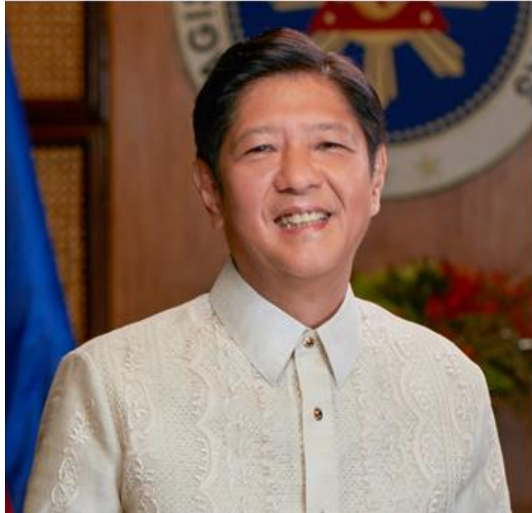
His Excellency FERDINAND ROMUALDEZ MARCOS, JR. 17 th President of the Philippines