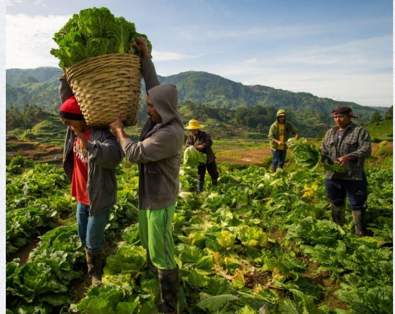
Department of Agriculture

The agriculture budget received a boost of more than 40% of its previous year's allocation, with P173.6B (USD 3.12 billion) .