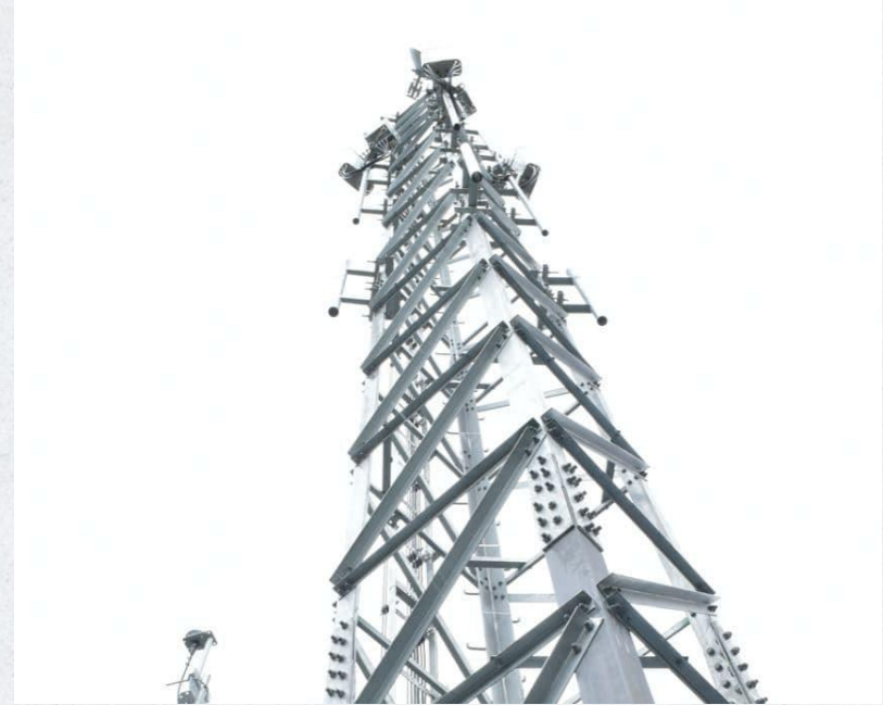
Department of Information and Communications Technology

We will invest in expanding and improving our digital infrastructure with at least P 12.1 B* (USD 217.8M) allocated for funding of ICT projects to strengthen interagency connection within the government and enhance transparency to the public.