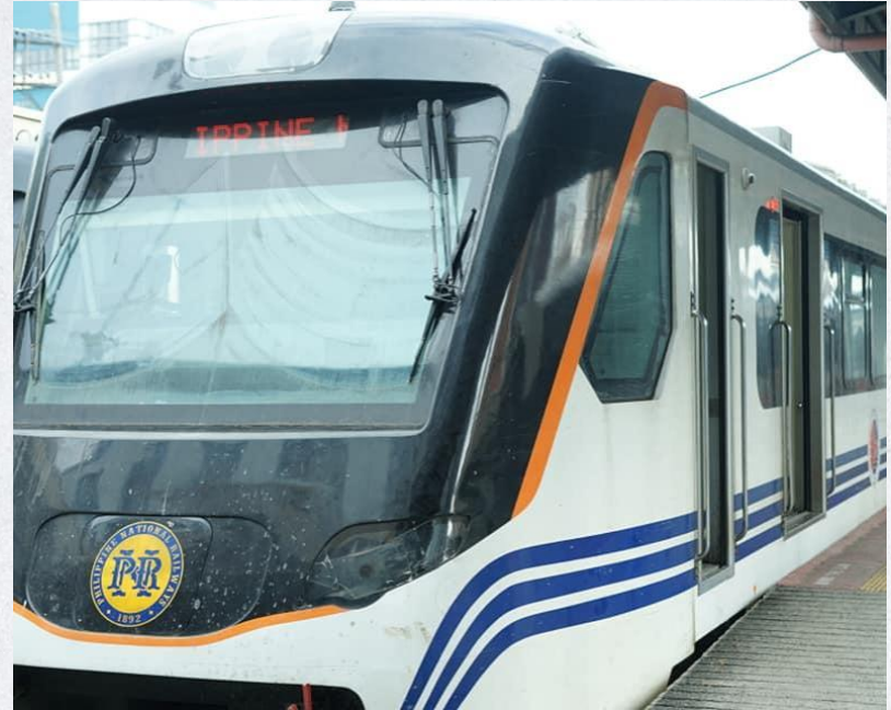
Department of Transportation

To improve transportation in the Philippines in line with the Administration's Build, Better, More Program, the Department of Transportation was allotted P106.0B (USD 1.91B) , a 40% increase from its previous year's allocation.