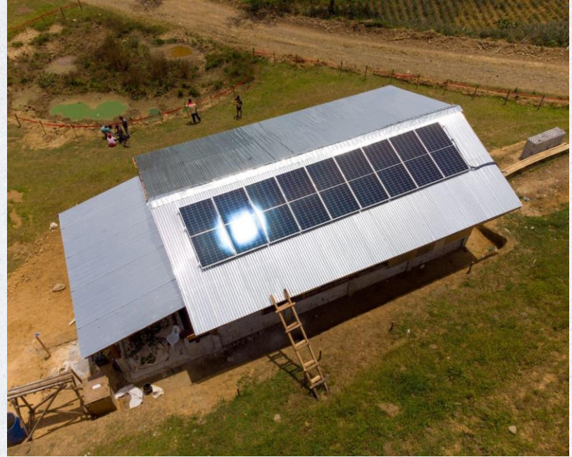
Department of Energy

The Department of Energy received P333.0M (USD 6.0M) for its Renewable Energy Development, Energy Efficiency and Conservation, and Alternative Fuels and Technologies Program.