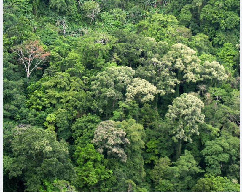
Department of Environment and Natural Resources

The budget for climate change adaptation and mitigation may reach P453.11B (USD 8.16B) in 2023, equivalent to 8.6% of the total proposed budget.