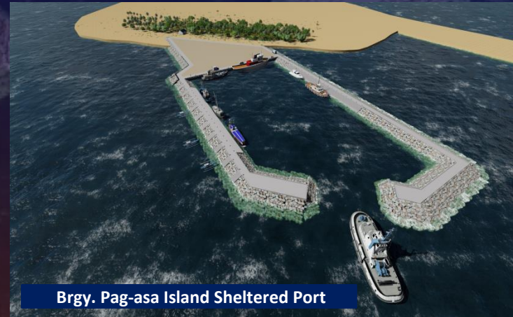
Brgy. Pag-asa Island Sheltered Port