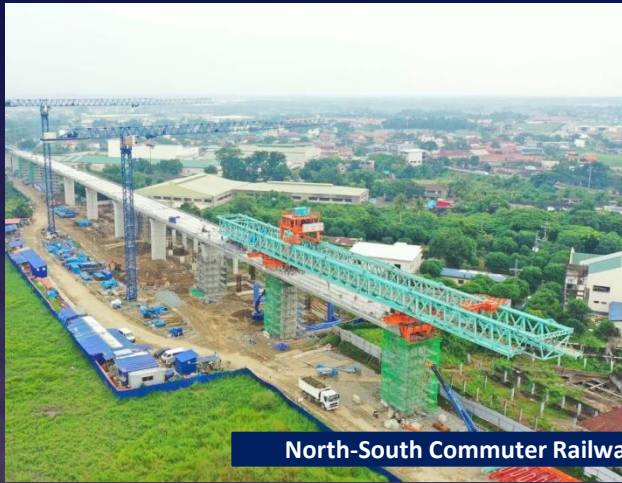
North-South Commuter Railway (NSCR)