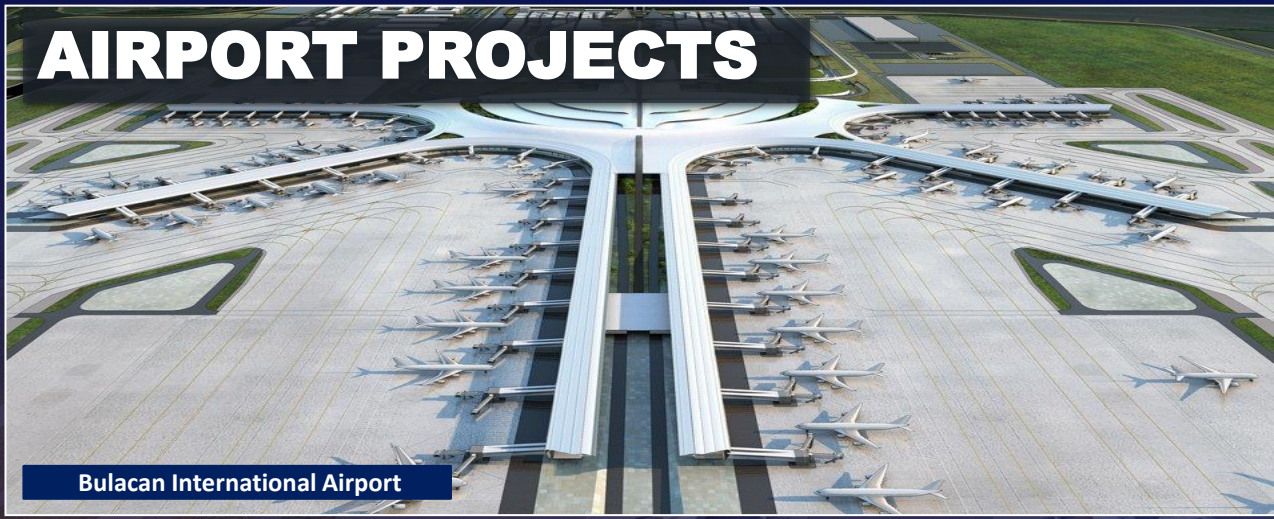
Bulacan International Airport