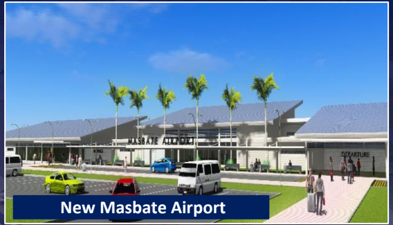
New Masbate Airport