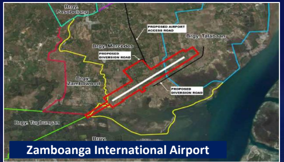
Zamboanga International Airport