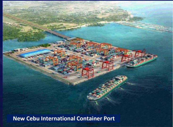
New Cebu International Container Port