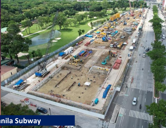
Metro Manila Subway