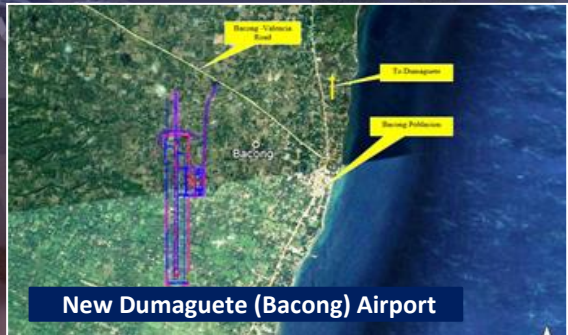
New Dumaguete (Bacong) Airport