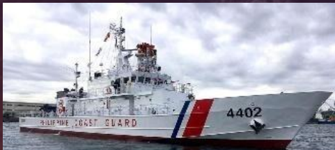
Maritime Safety Capability Improvement Project Phase II