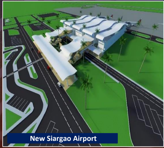
New Siargao Airport