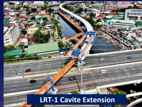
LRT-1 Cavite Extension