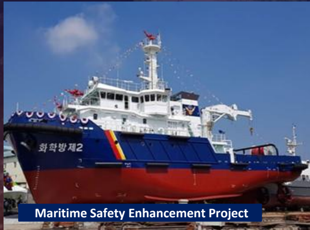
Maritime Safety Enhancement Project