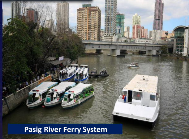
Pasig River Ferry System