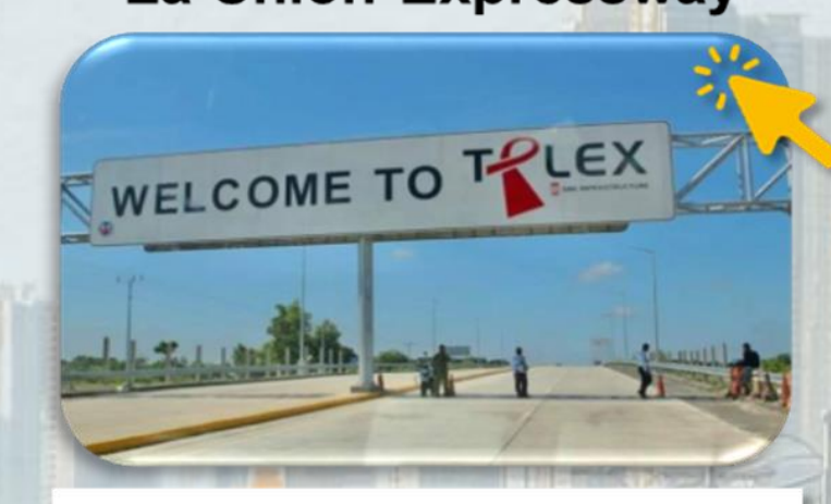
Tarlac-Pangasinan-La Union Expressway