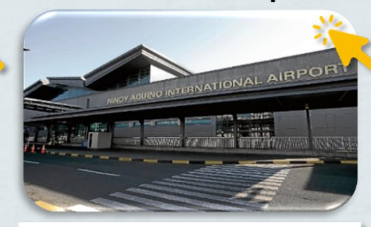
Ninoy Aquino International Airport