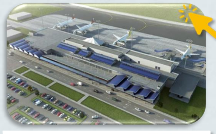
Laguindingan International Airport

*Governed by Revised 2022 IRR of BOT Law and Revised ICC Guidelines