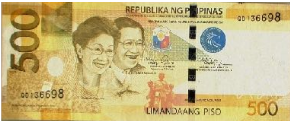
Missing OVD patch