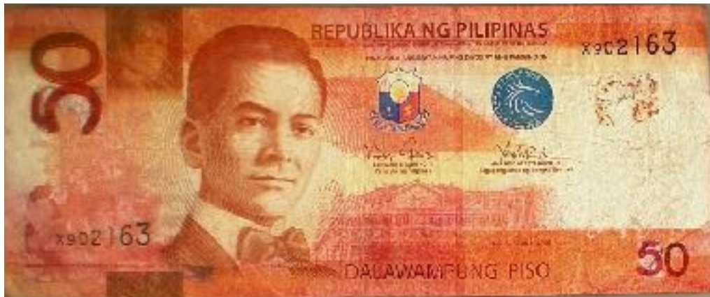
Altered value panel