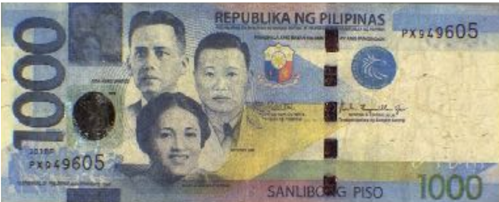
Counterfeit Peso notes