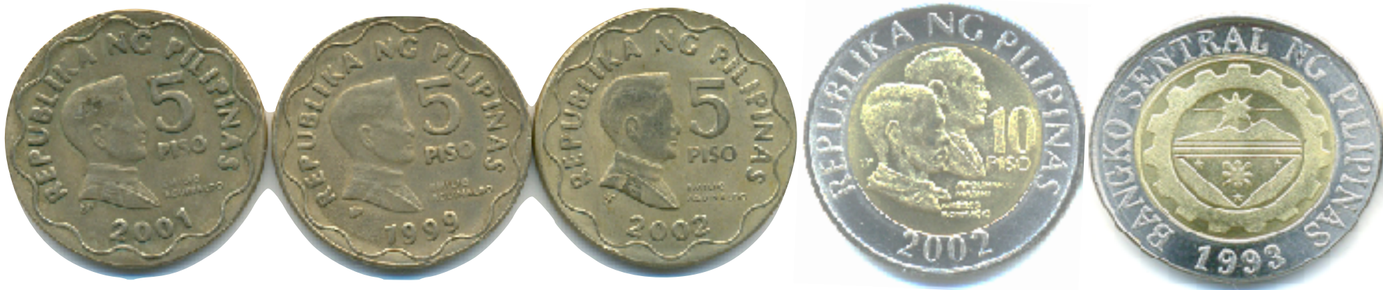
Counterfeit Peso coins