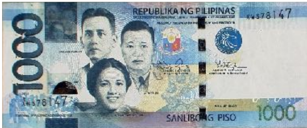
Defective OVD patch