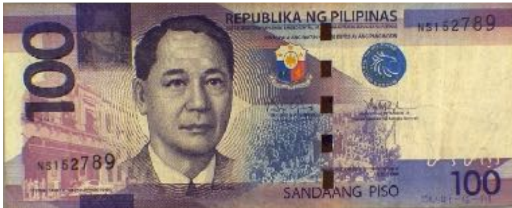
Altered security thread