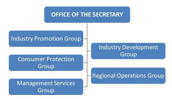
Figure 1. Organizational Set-Up of the Department of Trade and Industry

The efforts related to promoting domestic and international trade and commerce spearheaded by the Industry Promotion Group (IPG), supported by 7 bureaus: