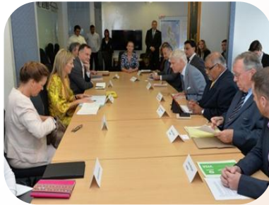
Meeting with Development Partners (UNDP, WB, etc.)