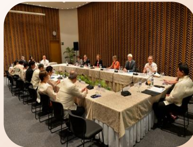
Meeting with the NSFI Heads of Agencies