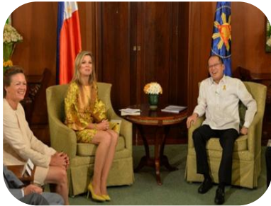
Meeting with President Benigno S. Aquino III