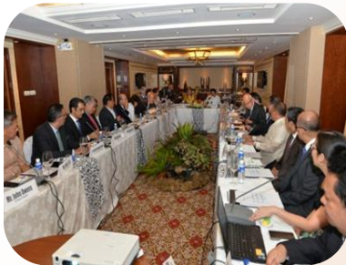
Meeting on the National Retail Payment System