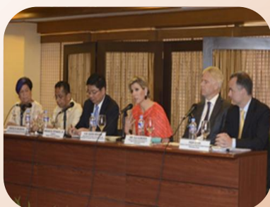
Press Conference after the NSFI launch