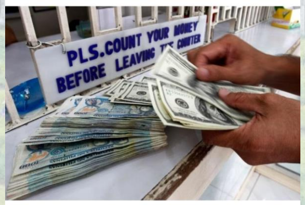
The Philippine economy grew 7.6 percent in the third quarter, ahead of expectations

Official says Southeast Asian economy on track to meet government's growth target for 2022.