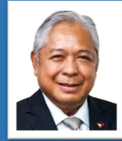
JAIME J. BAUTISTA Secretary Department of Transportation

Department of Transportation Secretary Jaime J. Bautista has a solid grounding in transportation having spent more than three decades in the aviation sector, culminating in being president of national flag carrier Philippine Airlines (PAL). He has strong financial management background, allowing him to steer PAL through its most turbulent times. He took on key posts at different private companies in different industries. He succeeded at turning the University of the East financially stable when he sat at the UE Board of Directors for more than two decades. He is a certified public accountant (CPA) and graduated magna cum laude with a degree in accountancy. He dislikes being praised. He endears himself to anyone at any time. He is known for his humility and disarming smile. He is soft-spoken with a fantastic memory.