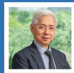
ALFREDO E. PASCUAL Secretary Department Trade and Industry