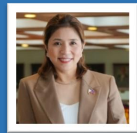
AMENAH F. PANGANDAMAN Secretary Department of Budget and Management

Sec. Mina has over 20 years of experience in government service. She was Assistant Governor of the Bangko Sentral ng Pilipinas, Undersecretary at the Department of Budget and Management, and Chief-of-Staff of former Senate President Edgardo Angara. This diverse background has inspired her transformational leadership as she passionately introduces reforms on inclusivity, sustainability, transparency, and bureaucratic efficiency, as encapsulated in the PBBM Administration's Agenda for Prosperity.