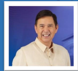
RALPH GONZALEZ RECTO Secretary Department of Finance

He also previously served as the Socioeconomic Planning Secretary of the National Economic and Development Authority (NEDA) in 2008.