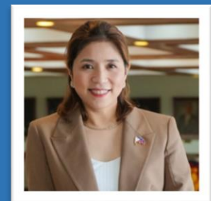
AMENAH F. PANGANDAMAN Secretary Department of Budget and Management

Sec. Mina has over 20 years of experience in government service. She was Assistant Governor of the Bangko Sentral ng Pilipinas, Undersecretary at the Department of Budget and Management, and Chief-of-Staff of former Senate President Edgardo Angara. This diverse background has inspired her transformational leadership as she passionately introduces reforms on inclusivity, sustainability, transparency, and bureaucratic efficiency, as encapsulated in the PBBM Administration's Agenda for Prosperity.