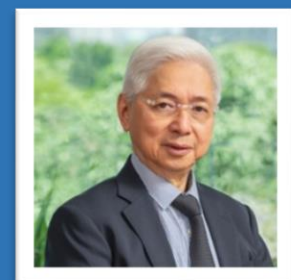
ALFREDO E. PASCUAL Secretary

He holds an MBA and BS in Chemistry (cum laude) from UP. His awards included Honorary Doctorates from the University of the Philippines and four other universities, the Presidential Lingkod Bayan Award from Malacanang, and the Rotary Golden Wheel Award for Higher Education.