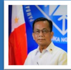
ARSENIO M. BALISACAN, PhD Secretary National Economic and Development Authority

For full CV: Secretary's Corner - National Economic and Development Authority (neda.gov.ph)