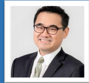
FREDERICK D. GO Secretary

Prior to his appointment as SAP-IEA, he was the Presidential Adviser for Investment and Economic Affairs for a year.