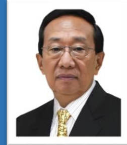
MANUEL M. BONOAN

Department of Transportation Secretary Jaime J. Bautista has a solid grounding in transportation having spent more than three decades in the aviation sector, culminating in being president of national flag carrier Philippine Airlines (PAL). He has strong financial management background, allowing him to steer PAL through its most turbulent times. He took on key posts at different private companies in different industries. He succeeded at turning the University of the East financially stable when he sat at the UE Board of Directors for more than two decades. He is a certified public accountant (CPA) and graduated magna cum laude with a degree in accountancy. He dislikes to be praised. He endears himself to anyone at any time. He is known for his humility and disarming smile. He is soft-spoken with a fantastic memory.