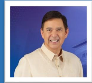
RALPH GONZALEZ RECTO Secretary Department of Finance

For full CV: Secretary's Page - Department of Finance (dof.gov.ph)