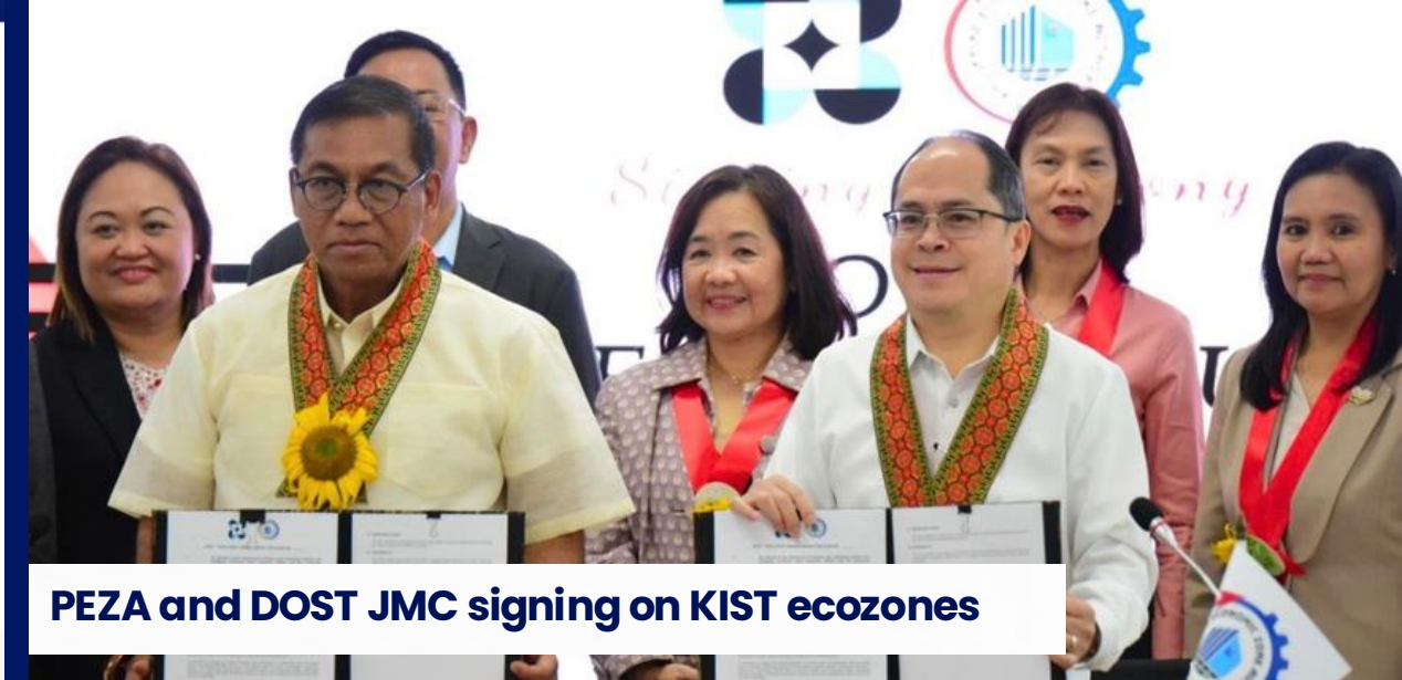
PEZA and DOST JMC signing on KIST ecozones