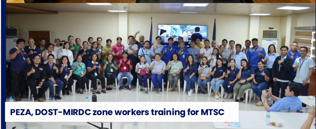
PEZA, DOST-MIRDC zone workers training for MTSC