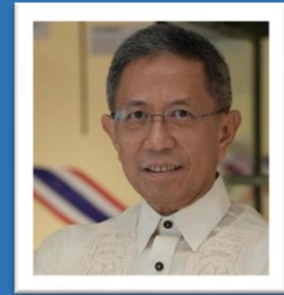
RAPHAEL P.M. LOTILLA Secretary Department of Energy

In the private sector, he was an independent director in several publicly listed conglomerates with diverse interests, including energy and financial services.