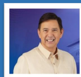
RALPH GONZALEZ RECTO Secretary Department of Finance

He also previously served as the Socioeconomic Planning Secretary of the National Economic and Development Authority in 2008.