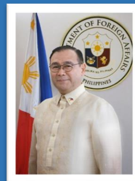
H.E. TEODORO L. LOCSIN, JR. Ambassador of the Philippines to the United Kingdom of Great Britain and Northern Ireland with Concurrent Jurisdiction over Ireland, Isle of Man, and Bailiwicks of Guernsey and Jersey