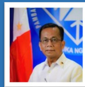
ARSENIO M. BALISACAN, PhD Secretary National Economic and Development Authority

He has authored and co-edited seven books and published, both locally and internationally, close to 100 academic papers and book chapters on various development issues, particularly in the Philippines and East Asia. He is also the author and co-editor of the upcoming book Designing Competition Policy for Economic Development in Asia .