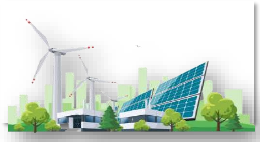
Green Energy Auction Program (GEAP)