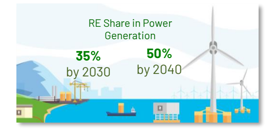
National Renewable Energy Program (NREP)