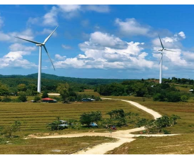
The 54-megawatt San Lorenzo Wind Farm in Guimaras Province