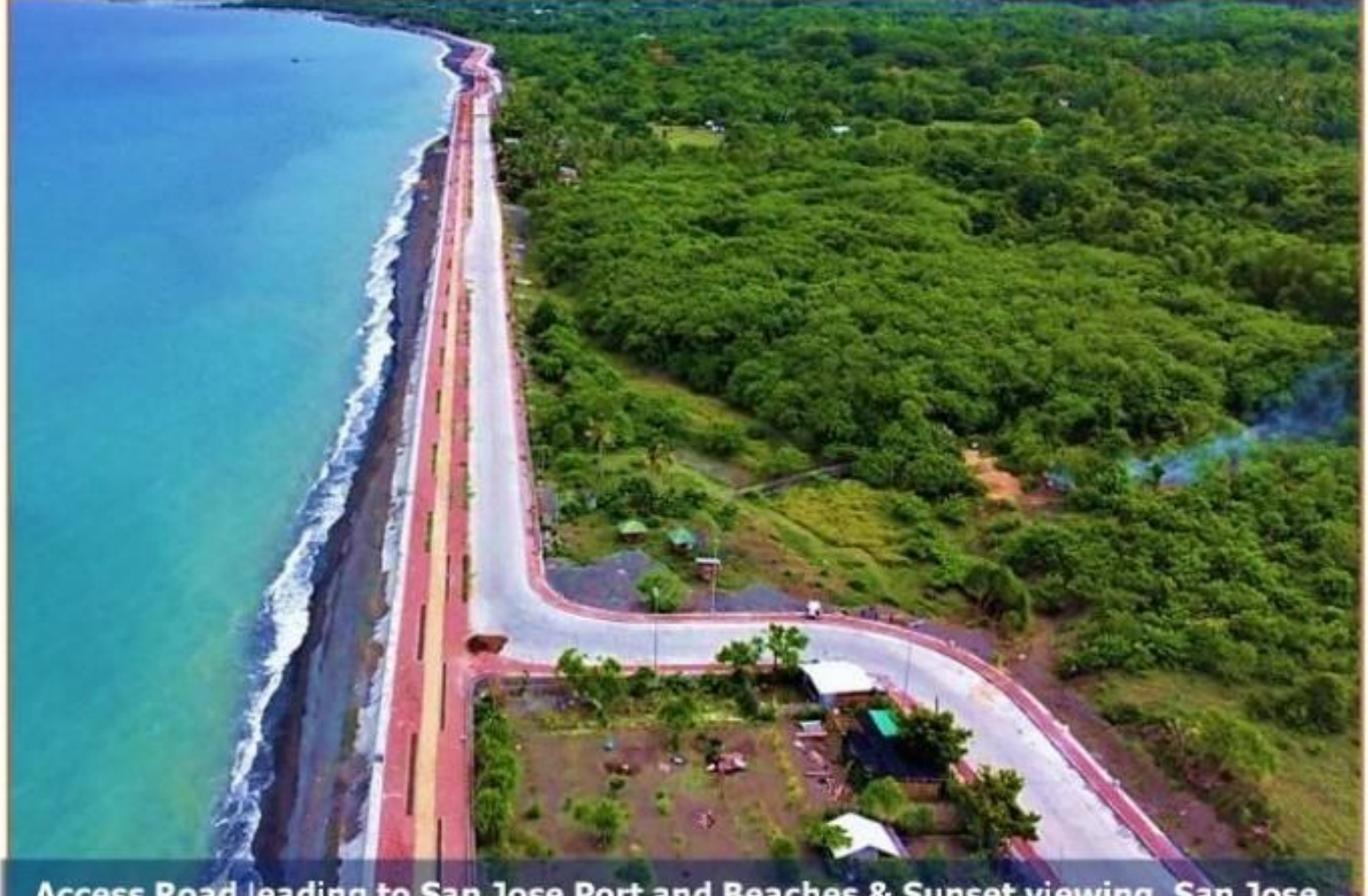
Access Road leading to San Jose Port and Beaches & Sunset viewing, San Jose Boulevard/Esplanade (Hotels, Inns and Beach Resorts)

Tangalan-Ibajay Road from Poblacion, Tangalan leading to Jawili Falls and Beach, Ibajay Mangrove Eco-Park, DENR Reforestation Project, Tangalan, Aklan