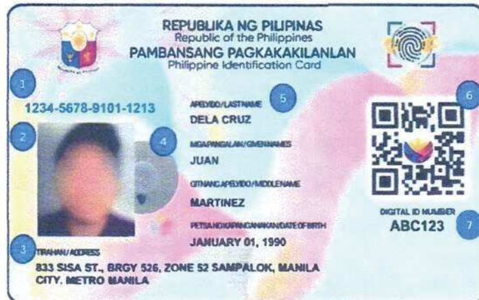
Image 1. The front portion of the Digital National ID 1

The Digital National ID includes the following information about the registered citizen: