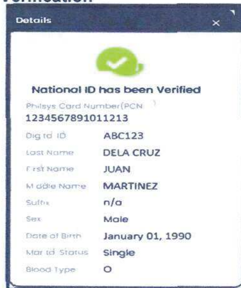
Image 3. Pop-up message of successful verification

Image 3 shows the following results when the verification of QR code is successful.