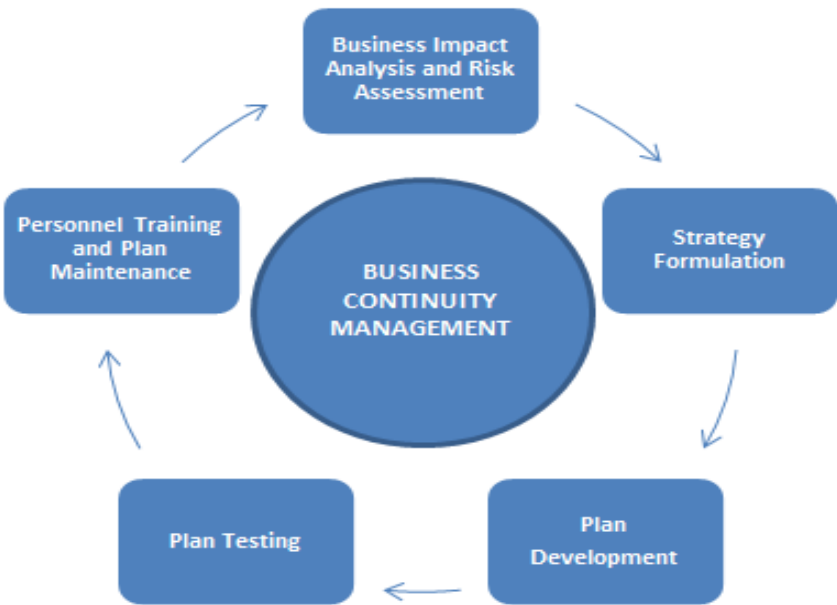
Figure 1. Business Continuity Management Process

framework, which, at a minimum, should include five (5) phases, namely: BIA and risk assessment, strategy formulation, plan development, plan testing, and personnel training and plan maintenance. This framework represents a continuous cycle that should evolve over time based on changes in business and operating environment, audit recommendations, and test results. This framework should cover each business function and the technology that supports it. Other related policies, standards, and processes should also be integrated in the overall BCM framework.