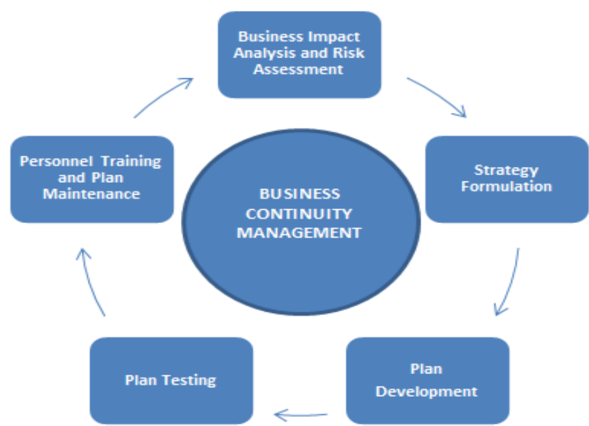
Figure 1. Business Continuity Management Process

risk assessment, strategy formulation, plan development, plan testing, and personnel training and plan maintenance. This framework represents a continuous cycle that should evolve over time based on changes in business and operating environment, audit recommendations, and test results. This framework should cover each business function and the technology that supports it. Other related policies, standards, and processes should also be integrated in the overall BCM framework.