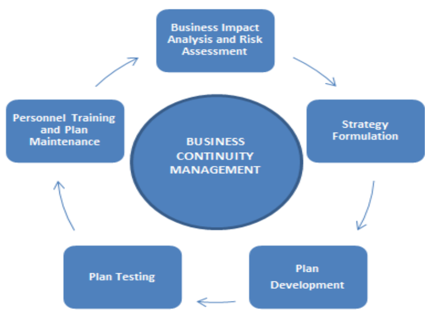
Figure 1. Business Continuity Management Process

a. Business impact analysis and risk assessment. A comprehensive BIA and risk assessment should be undertaken to serve as the foundation in the development of the plan. The BIA entails determining and assessing the potential impact of disruptions to critical business functions, processes, and their interdependencies through work-flow analyses, enterprise-wide interviews, and/or inventory questions. Accordingly, the BSFI should determine the recovery priority, RTO, RPO, and the minimum level of resources required to ensure continuity of its operations consistent with the criticality of business function and technology that supports it. The BSFI should then conduct risk assessment incorporating the results of the BIA and evaluating the probability and severity of a wide-range of plausible threat scenarios in order to come up with recovery strategies that are commensurate with the nature, scale, and complexity of its business functions.