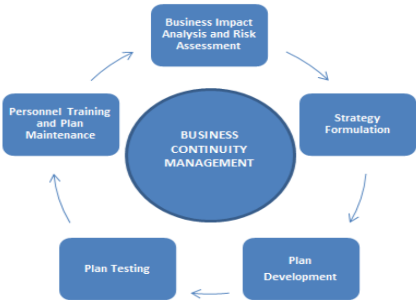
Figure 1. Business Continuity Management Process

§ 4176T.4 Business continuity management framework. BSFIs should adopt a cyclical, process-oriented BCM framework, which, at a minimum, should include five (5) phases, namely: BIA and risk assessment, strategy formulation, plan development, plan testing, and personnel training and plan maintenance. This framework represents a continuous cycle that should evolve over time based on changes in business and operating environment, audit recommendations, and test results. This framework should cover