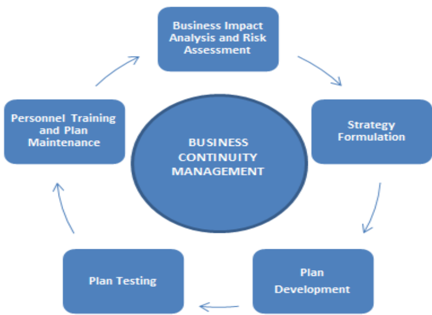
Figure 1. Business Continuity Management Process

adopt a cyclical, process-oriented BCM framework, which, at a minimum, should include five (5) phases, namely: BIA and risk assessment, strategy formulation, plan development, plan testing, and personnel training and plan maintenance. This framework represents a continuous cycle that should evolve over time based on changes in business and operating environment, audit recommendations, and test results. This framework should cover each business function and the technology that supports it. Other related policies, standards, and processes should also be integrated in the overall BCM framework.