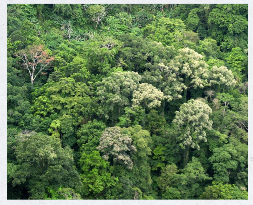
Department of Environment and Natural Resources

*Based on the FY 2023 National Expenditure Program