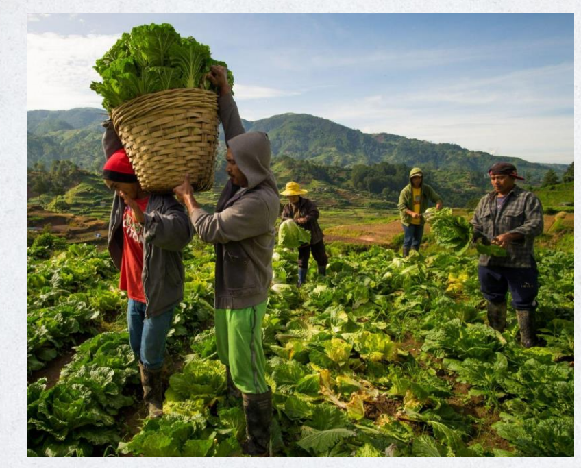
Department of Agriculture

The agriculture budget received a boost of more than 40% of its previous year's allocation, with P173.6B (USD 3.12 billion).